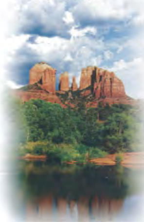
Cathedral Rock, Sedona

Winter: mild with 55-65F (12-18C) with occasional days below freezing. There is rarely any snow.