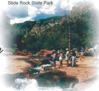
Slide Rock State Park