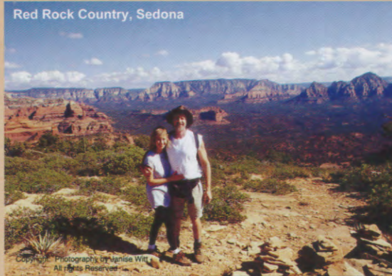
Red Rock Country, Sedona

For more information about what to see and what to do in the Sedona Verde Valley area including links to the various calendars of events, visit the official website at www.SedonaVerdeValley.org